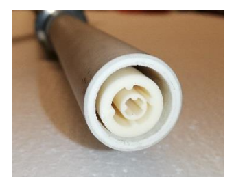
Figure 3 Mount 1. and 2. ceramic radiation shield and finally the 3. radiation shield using 3/4" thread. Do not use force to mount parts. A plier might be used to demount the 3. radiation shield after use (only use force on stainless steel mount as ceramic becomes fragile after use).