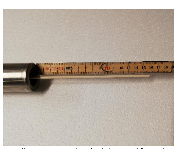
Figure 2 Platinum type R thermocouple protected in a 3 mm diameter ceramic tube is inserted from the rear end through Ø4 mm hole (care: ceramics is fragile, i.e. do not bend or hit anything). Push thermocouple forward until tip is approx. 14-16 cm in front of the water-cooled probe. A small leak of air through the tube where the thermocouple is inserted to prevent dirt to stick on cable a sensor in the water-cooled part of the probe.