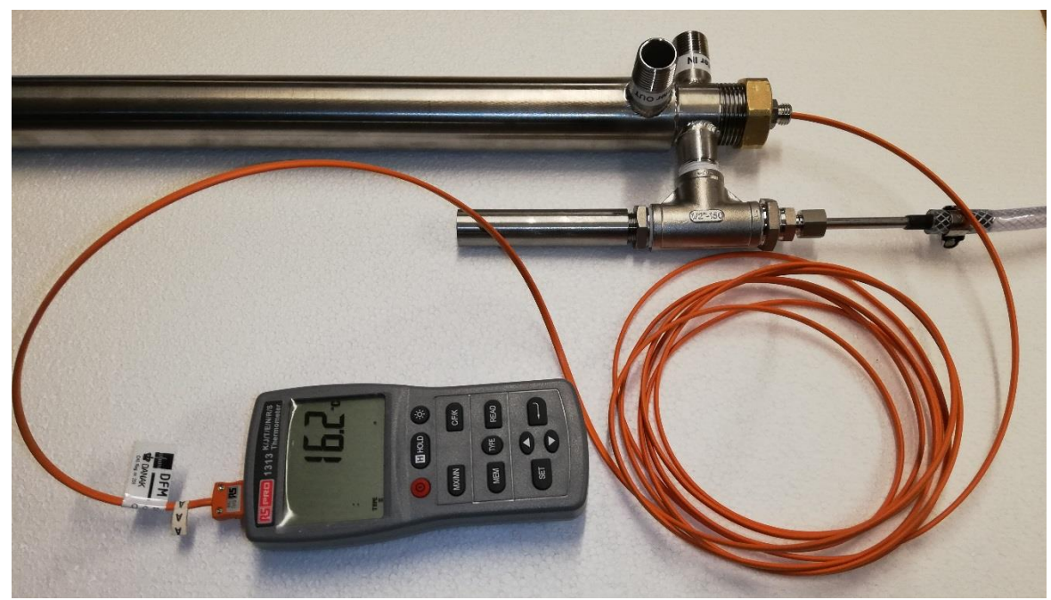
Figure 4 The injector is shown mounted on water-cooled suction pyrometer. Adjust nozzle position of injector to obtain max gas flow (test with a finger at tip of ceramics).

Remove 1" cap from rear end of suction pyrometer to clean the suction pyrometer if it is needed.