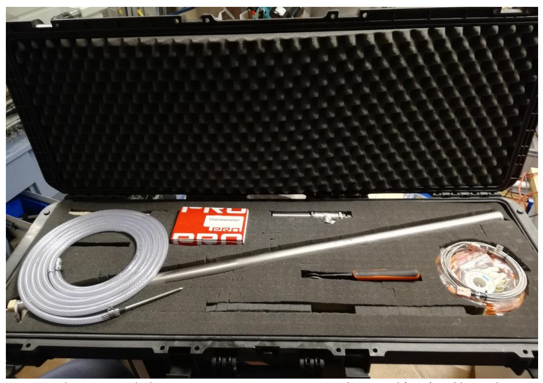
Figure 1 Case with water-cooled suction pyrometer, injector stainless steel (316), calibrated thermometer, type R thermocouple (max. 1500°C), type N thermocouple (max. 1250°C, but works up to 1300°C with reduced life time), ceramic shields and tools.